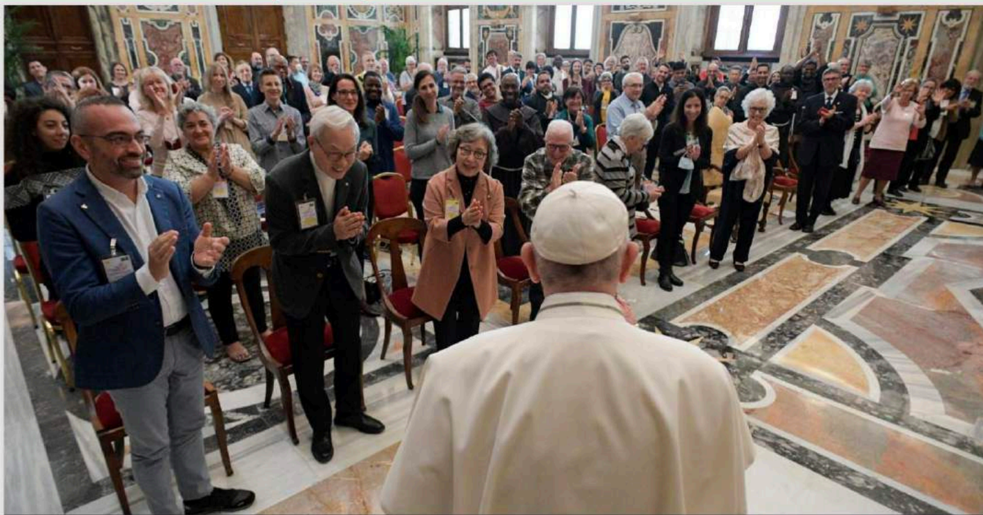
Pope Francis meets with members of the Secular Franciscan Order