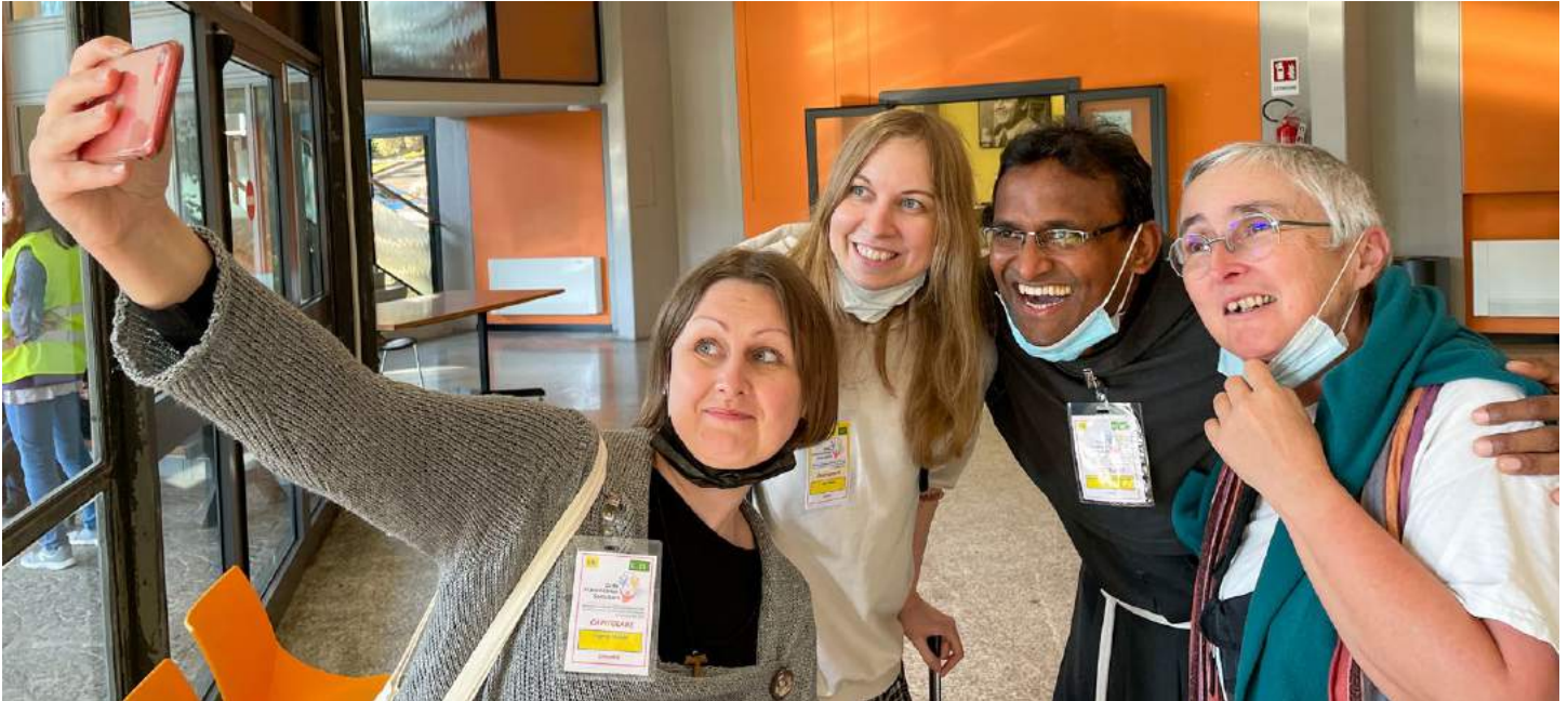
There were many selfie moments as delegates and observers arrived at the General Chapter.

The delegates who comprise the International Council of the OFS (CIOFS) meet every three years, and every six years elect new servant leaders to serve on the Presidency (or international executive council). Because of the pandemic, the outgoing Presidency's term went from six years to seven.