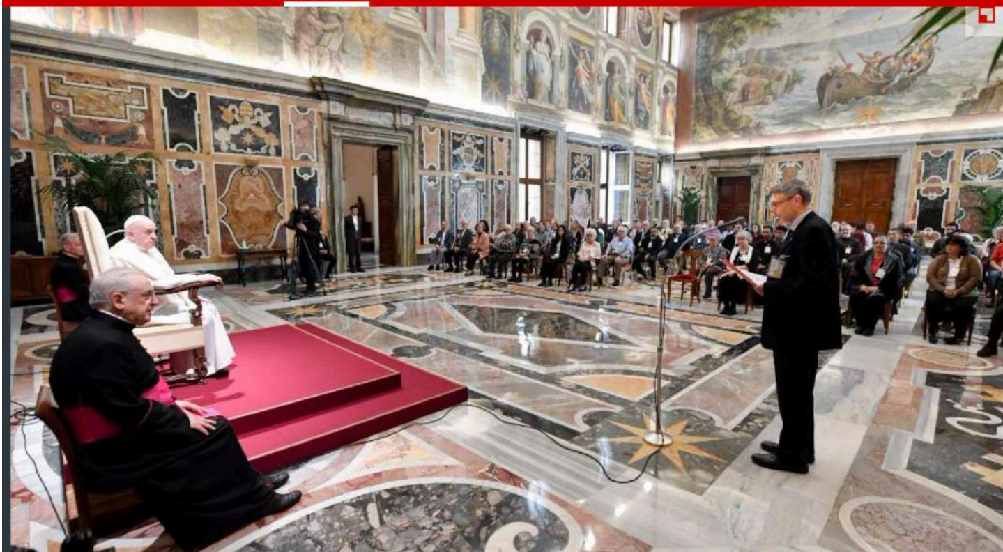
Minister General Tibor Kauser, OFS, addresses Pope Francis.