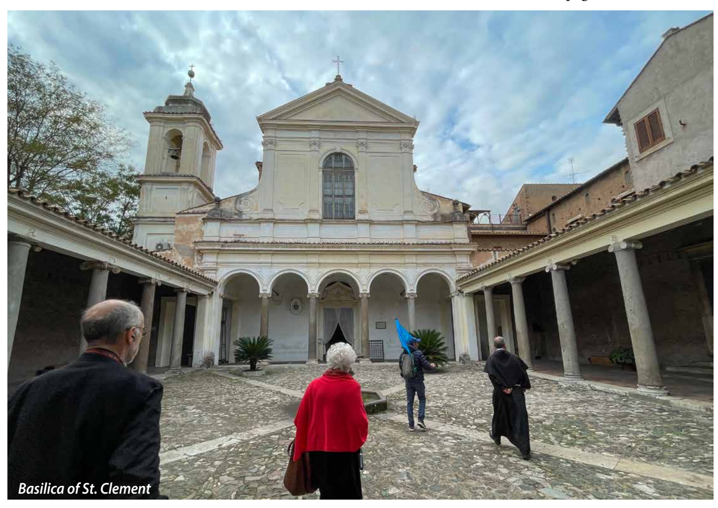
VOX Franciscana • 6 • WINTER / SPRING 2023