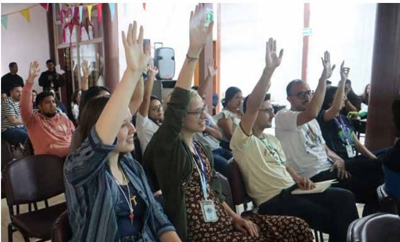
Continued from previous page.

love that sprang up between them and how they spread a true affection... Love that was manifested in the chaste embraces, in tender affections, in the holy kiss, in the agreeable conversation, in the modest laugh, in the festive face, in the simple eye, in the humble