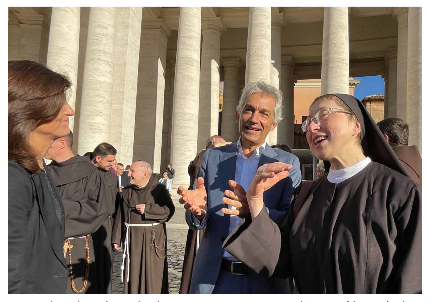
Friars, seculars and Poor Clares gathered in St. Peter's Square, expressing joy at being part of the same family.