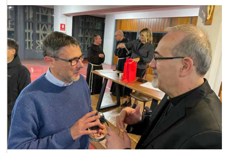
OFS Minister General Tibor Kauser chats with Archbishop Pierbattista Pizzaballa, Latin Patriarch of Jerusalem.