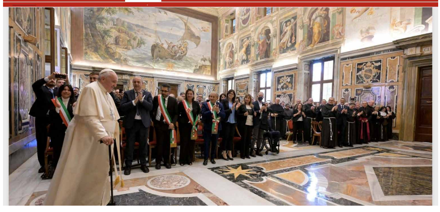
Pope Francis greets members of the Franciscan Family during a private audience Oct. 31.