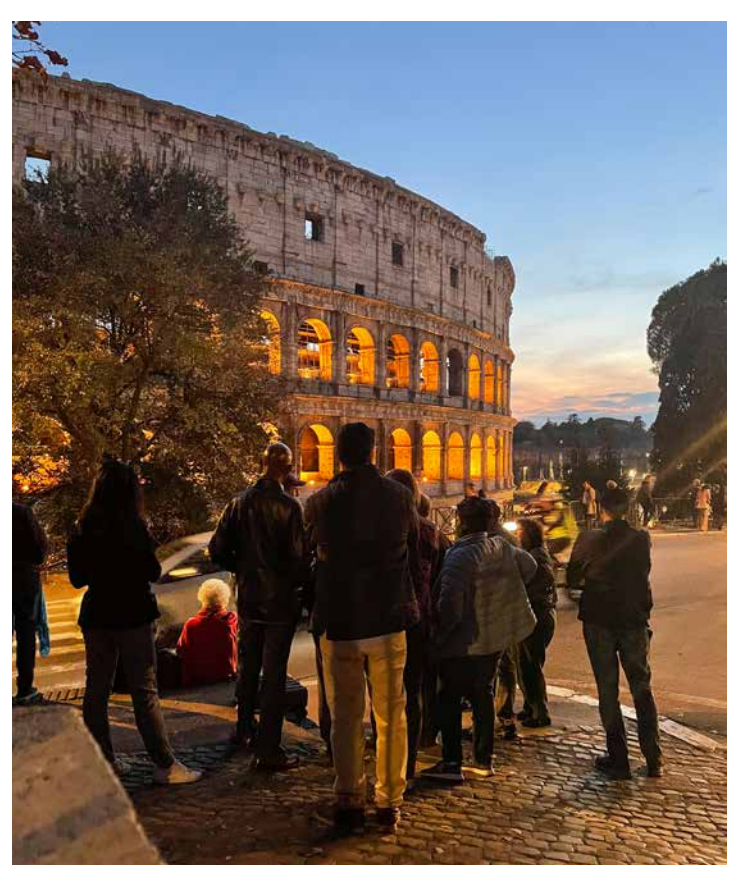
Members gather around tour guide at the Colosseum.